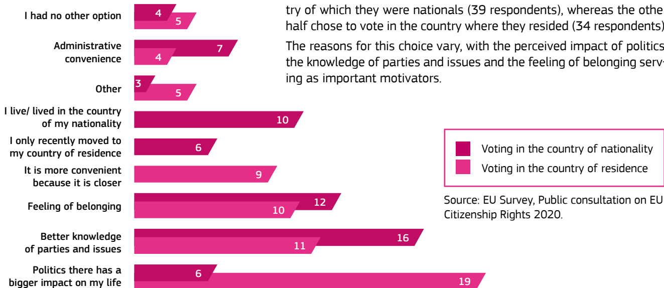
Figure 3 – Reasons for voting in the country of residence vs. in the country of citizenship (number of respondents)

85% of the respondents voted in the last European parliamentary elections in 2019. Almost 70% of them lived in their country of origin and one third lived in another EU Member State. Of those living in another Member State, almost half voted for candidates in the country of which they were nationals (39 respondents), whereas the other half chose to vote in the country where they resided (34 respondents).